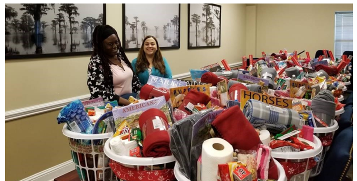
“Baskets of Love” pictured above were delivered to needy seniors throughout the region.